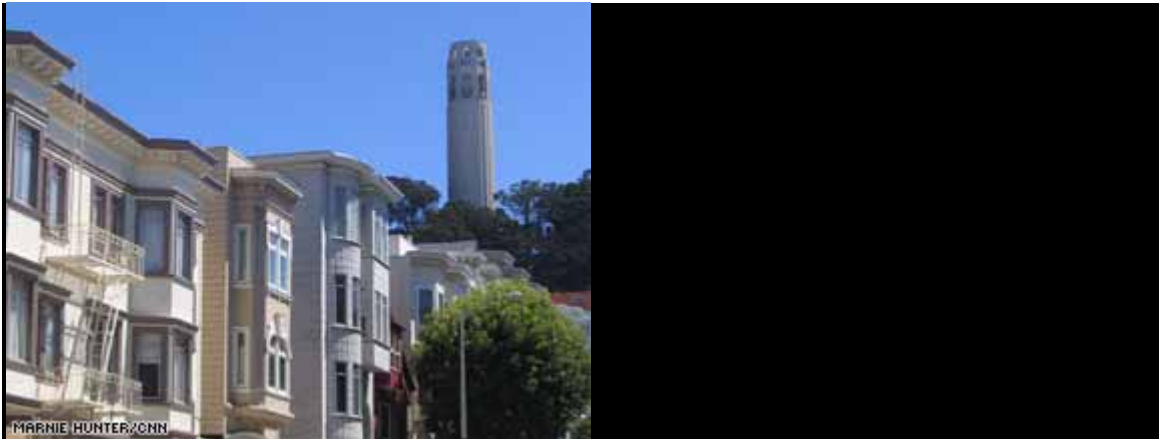
Voters ranked San Francisco No. 1 for notable neighborhoods.

(Travel + Leisure) -- Say you're in the mood to indulge in a shoe-shopping spree -- does a certain city pop to mind? How about an urban destination for a romantic weekend? Where in the U.S. can you find the most compelling museums or thrilling club scene? Is the city with the most attractive citizens also the one with the best opportunities for people-watching?